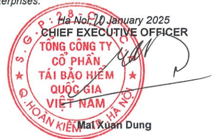
Mat Xuan Dung